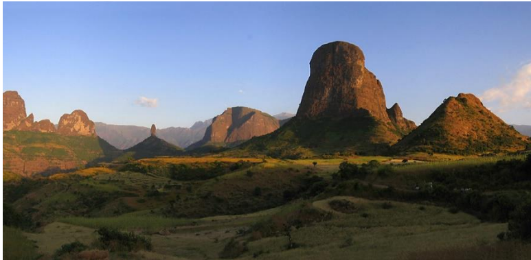
Simien National Park, Ethiopia

Meanwhile, two African properties were removed from the World Heritage List in Danger. These are Comoe National Park (Cote d'Ivoire) and Simien National Park (Ethiopia). Our congratulations to the States Parties of Cote d'Ivoire and Ethiopia for their outstanding achievements.