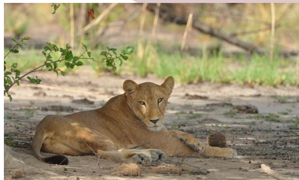
Lion in the W. Arly Pendjari Complex, Benin and Burkina Faso

The results above are significant and constitute a serious way forward for World Heritage implementation in the African region. These results were achieved through efforts by many stakeholders working closely with the African World Heritage Fund including the World Heritage Committee members (Angola, Burkina Faso, Tanzania, Tunisia and Zimbabwe), the World Heritage Centre and Advisory Bodies as well as the Centre for Heritage Development in Africa (CHDA) and the School of African Heritage (EPA). AWHF commend the excellent spirit of fruitful partnerships and wishes to congratulate the States Parties of Angola, Benin, Burkina Faso, Eritrea and South Africa for their successful achievements.