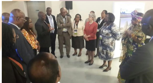
Opening of the Exhibition