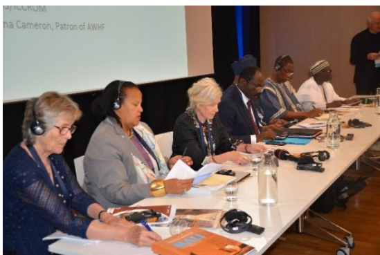
Side Event proceedings