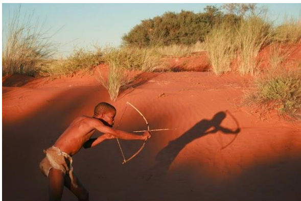
Khomani Cultural Landscape, South Africa