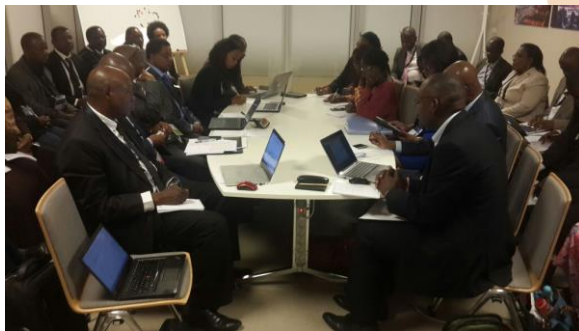
Meeting of African Delegations @AWHF

Furthermore, AWHF held meetings with several delegations on issues related to partnerships and to further strengthen relations and growth opportunities for the Fund. The delegations engaged included the Minister of Environment of Burkina Faso, the delegation of China and Norway and daily meetings which were held with the African delegations.