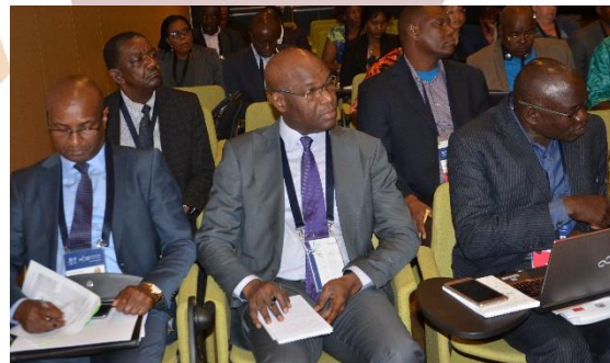
Meeting of African Delegations