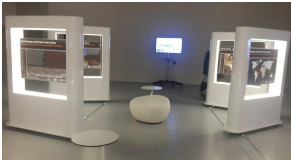
Exhibition on Slave Trade

The AWHF's exhibition was displayed from 2nd to 5th July 2017. It comprised eight printed panels showcasing various angles of slavery related experiences through a combination of photos, maps and texts. The launching ceremony was organised on 3 rd July in the presence of esteemed officials including the Minister of Sanitation, Environment and Sustainable Development of Cote d'Ivoire, Ms Anne Desiree Ouloto and the Director General of UNESCO, Ms. Irina Bokova. The launch was structured in a guided tour followed with a group photo of the officials. The exhibition was aimed at giving an opportunity to interrogate the current representation of slavery experiences on the Tentative and World Heritage Lists. It was also an attempt to showcase the richness and diversity of slavery sites. For more information, visit our website .