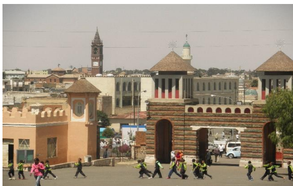
Asmara, Eritrea

These are Mbanza Kongo (Angola), Asmara, a Modernist City of Africa (Eritrea), Khomani Cultural Landscape (South Africa) and W-Arly-Pendjari Complex (Benin, Burkina Faso) which is an extension of W National Park of Niger inscribed since 1996. With these inscriptions, Angola and Eritrea made their first entries to the World Heritage List while Benin and Burkina Faso inscribed their first natural site. South Africa joined Morocco and Ethiopia hosting within its boundaries the highest number (9) of World Heritage Sites in Africa.