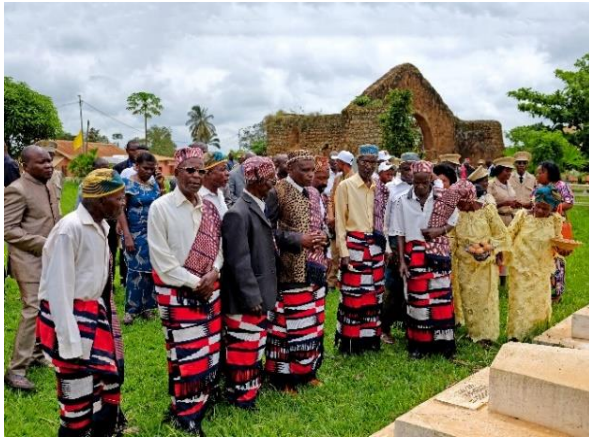
Mbanza Kongo, Angola